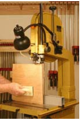
With the addition of our riser block kit, the PWBS-14 resaw capacity increases to 12" from the upper guide to the table surface!

When large capacity resawing is required, the #1791217, 6" riser kit increases the maximum clearance between the upper guides and the table surface to 12". The riser kit supplies all of the parts needed to make the conversion including the 6" block, retaining bolt, extended upper guide post, expandable upper blade guard and even a 3/8"-wide general purpose 105" blade to get you started. A single instruction sheet walks you through the process of installing the riser kit.